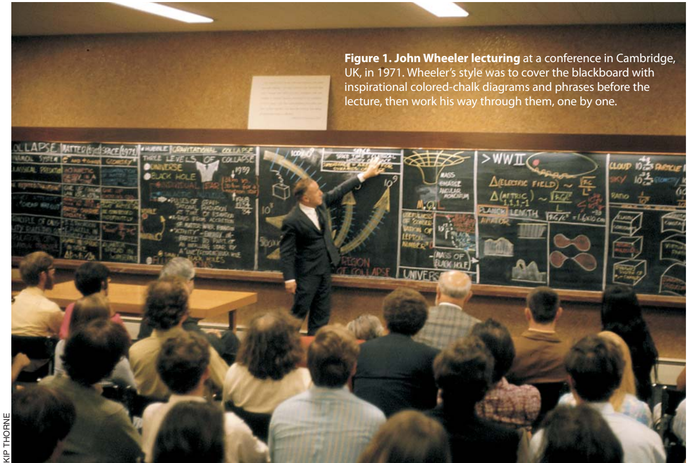
Figure 1. John Wheeler lecturing at a conference in Cambridge, UK, in 1971. Wheeler's style was to cover the blackboard with inspirational colored-chalk diagrams and phrases before the lecture, then work his way through them, one by one.