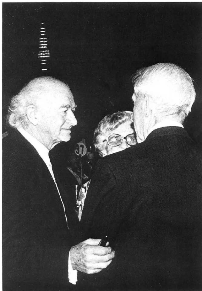
Linus Pauling greets old friends during awards dinner

What have the consequences been? The results viewed as science qua science have been mixed. There are plenty of examples of poor planning and even corruption in the use of funds. The number of NMR machines lying around the world still in the original shipping crates is depressing and representative of a problem. However, the volume of useful scientific publication from developing nations is increasing and surely international assistance is partly responsible. Unfortunately, it also is true that the fraction of the total scientific publication coming from the poor nations has decreased; not surprisingly the rich have found it easier and more efficient to help themselves than to help the poor.