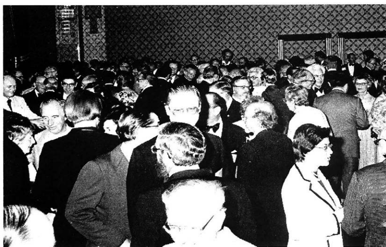
The reception prior to the awards dinner attracted a big crowd

I also believe that international development of chemical and other scientific education continues to be a worthy cause. However, I do believe that we should be far less didactic in our approaches because we do not ourselves have a satisfactorily dynamic system and because direct transplantation of our system may be incompatible with the receiving culture. Here again I believe there is remarkable opportunity for real international cooperation. For example, Americans like to keep playing with new forms of visual aids to education, even though we know that the techniques are a long way from perfected. I suggest that we would do well to work with people from other cultures in these efforts and that the added insights concerning perceptual impact might help create products vastly more useful for everyone. I have an ambition, which I probably never will fulfill, to coauthor a textbook with a colleague whose native tongue is not English. It would be challenging to work out the chemistry with such a person and to see the book being created simultaneously in two languages. I could go on with other examples but time will not permit me to do so.