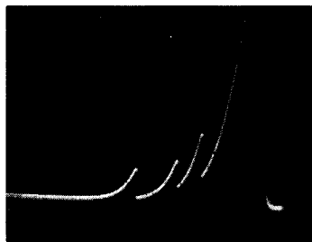
FIG. 3. Laser action of a \text{Ca}(\text{NbO}_3)_2:\text{Tm}^{3+} crystal at 1.91 \mu , at 77^\circ\text{K} , and observed with a PbSe detector. The lamp input energy was 160 J.

The threshold of oscillation for the \text{Pr}^{3+} , \text{Ti}^{4+} compensated: \text{Ca}(\text{NbO}_3)_2 crystals was 20–25 J at 77^\circ\text{K} and the wavelength of the stimulated radiation was 1.04 \mu . Laser action on the \text{Ti}^{4+} -charge-compensated, \text{Tm}^{3+} and \text{Er}^{3+} doped crystals occurred, respectively, at 1.91 and 1.61 \mu and the thresholds for the onset of the oscillations were 125 and 800 J, respectively. Figure 3 shows the familiar pattern of laser oscillations for a \text{Tm}^{3+} doped crystal with the energy input to the lamps of 160 J. It is believed that the threshold values for laser action in \text{Nd}^{3+} , \text{Ho}^{3+} , \text{Er}^{3+} , \text{Tm}^{3+} , and \text{Pr}^{3+} doped crystals can be further lowered by optimizing doping concentrations and by improving crystal quality.