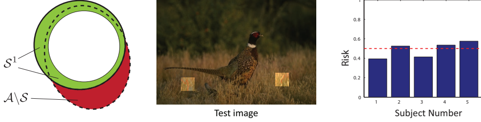
Figure 1: An illustration of our two-way, forced choice experiment. The left figure shows the Venn diagram of boundary subsets. The thick circle encompasses the full boundary set \mathcal{S} . Within \mathcal{S} , the set of orphan labels \mathcal{S}^1 is shown in green. The pB boundary set \mathcal{A} is the dotted ellipsoid. The set of edges falsely identified by the algorithm, \mathcal{A} \setminus \mathcal{S} , is highlighted in red. In each trial, we randomly select one boundary segment from \mathcal{S}^1 (green ring) and another from \mathcal{A} \setminus \mathcal{S} (red ellipsoid) and ask subjects to judge which one is perceptually stronger. Two boundary segments (high contrast squares with red lines) are superimposed onto the original image (shown in the middle figure). At the same time, the original is also presented to the subject in a separate window. In total, 100 image pairs are compared by all 5 subjects. The right figure shows the risk (that is, how often the false-alarm algorithmic edges are preferred over the human labels), of this database for all 5 subjects. Dotted line is chance level (0.5).

to choose an appropriate threshold, and form a subset of boundary segments that balances risk and utility , which we refer to the total available number of data-points in the selected subset. In the next section, we present a graphical model that estimates the boundary perceptual strength.