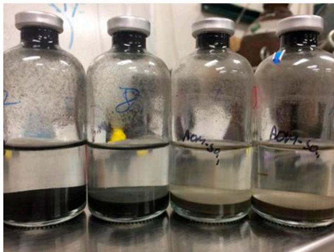
Fig. S2. The bottles treated with hematite addition after 180 d. The two on the Right are the killed control, and their color remained brown throughout the experiment, whereas the two on the Left have become black with time, likely due to precipitation of Fe(II) sulfide particles.