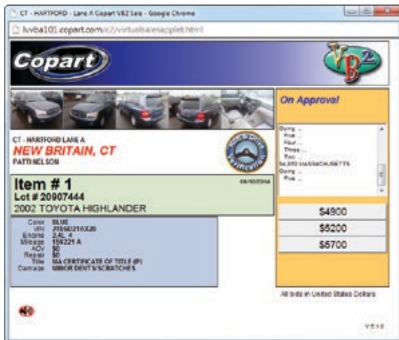
FIGURE 1. SCREENSHOT OF COPART BIDDER SCREEN