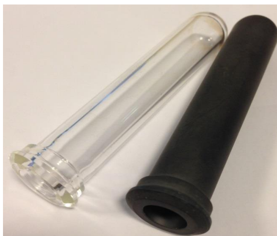
Figure S1. Glass and SiC vials available for the Anton Paar Monowave 300 microwave reactor. Both vials have the same geometry.

The thermophysical properties of the two vials are presented in Table S1.