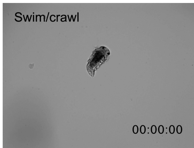
Movie S1. Time-lapse microscopy of Hydroides metamorphosis in response to a bacterial biofilm of P. luteoviolacea . Time is h:min:s.