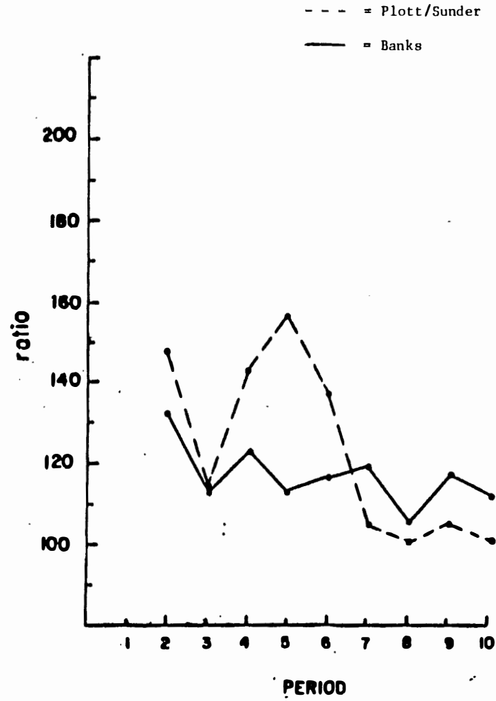
b. ratio of informed trader profits to uninformed trader profits