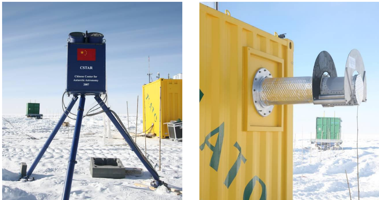
Fig. 3. Left: the CSTAR optical telescope array tripod-mounted on the snow surface. Right: the Pre-HEAT sub-millimetre telescope mounted through the PLATO instrument module side wall. The PLATO engine module is located in the background of both pictures.

Pre-HEAT is designed as a light weight, low power, fully autonomous instrument. It consists of a 0.2 m f/5 parabolic mirror at the end of an enclosed telescope assembly tube which mounts through a port in the PLATO side wall. The mirror scans the sky in elevation and has a co-rotating external (teflon) window. The receiver, a 660 GHz Schottky diode system, is mounted inside PLATO on a sensor assembly unit which also houses the IF processor, IF power detector, and digital FFT spectrometer. Pre-HEAT uses a PC104 single board computer with 8 GB flash disc hard drives.