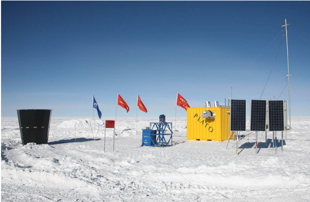
Fig. 2. Picture of the PLATO observatory installation at Dome A station. The PLATO instrument module is centre right surrounded by the solar panel array, the CSTAR telescopes (centre) and the SNODAR instrument (left).

supply for a minimum of one year between servicing. The fuel tank contains enough capacity for greater than nine months of continuous running and is also used to store heat from the engines to help regulate the internal temperature of the module. In addition, each engine is installed with its own bulk oil filtration and recirculation system in order to extend the required servicing interval from the nominal 200 hours of a stock engine, to the ~2000 hours we require.